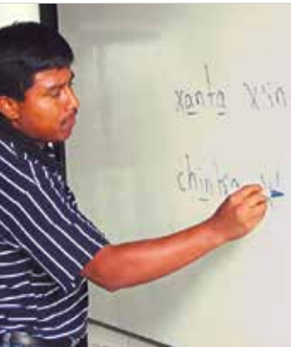
Participants learn to confidently transfer to others what they learned as they take leadership in documenting and preserving their linguistic and cultural heritage.