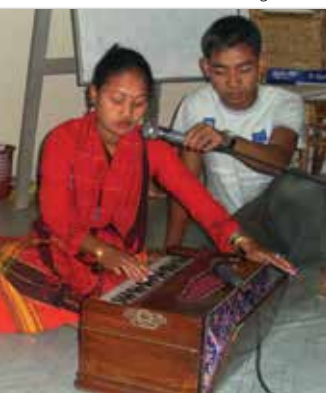
The harmonium is a common instrument in Bangladesh.