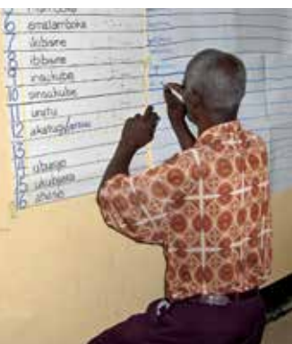
Workshop participants use their knowledge of the language in analysis exercises.

Seeing his language in print, a Simbiti speaker exclaimed, “A veil has been lifted from my eyes about my language. It has so much beauty!”