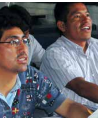
Every day students and teachers alike learn something new.

GUATEMALA—Children in Guatemala watch an Ixil video “My Heart Language,” written and filmed by an Ixil video crew. It was created to teach Ixil people to read their language. This local team now writes, films and edits their own videos, and they are ready to help others do the same.